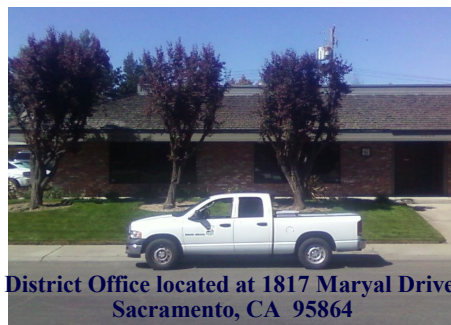
District Office located at 1817 Maryal Drive, Sacramento, CA 95864